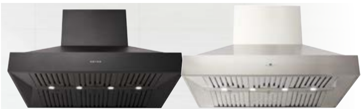
// CL8912BS (120 cm, matte black) and CL8912S (120 cm, stainless steel)